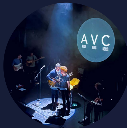
Performances at the Jacques Bravo Center 14-18, rue de la Tour des Dames, Paris 9th arrondissement July 1 st , October 19 th and 21 st , 2023