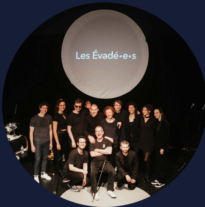
7 artists on stage, 3 technicians and 2 companions

In its genesis as in its realization, our project echoes the law of February 11, 2005 for "equal rights and opportunities, participation and citizenship of persons with disabilities."